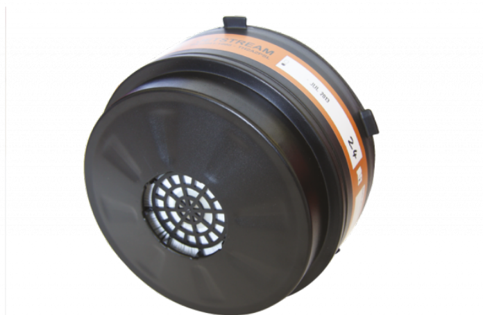
A2P SL filter

Jetstream® Dust & Gas Filter TH2A2P R SL / CBU620-000-000